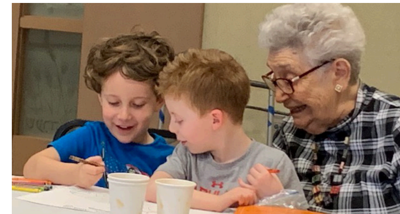
Beth El Seniors and BEPS Pre-K children spend time together once a month.