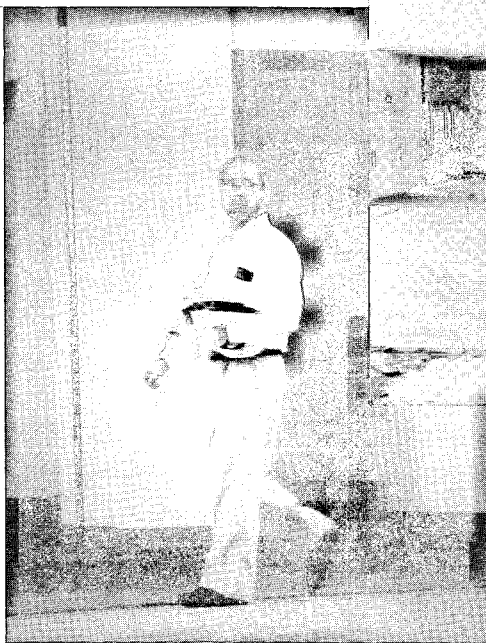
"Who stole the shul?"