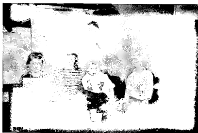
Bonim: grades K-2