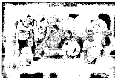
USY: grades 9-12