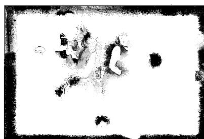
Machar: grades 3-5