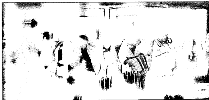
Women at the Membership Dinner modeling tallitot made at the Tallit Workshop